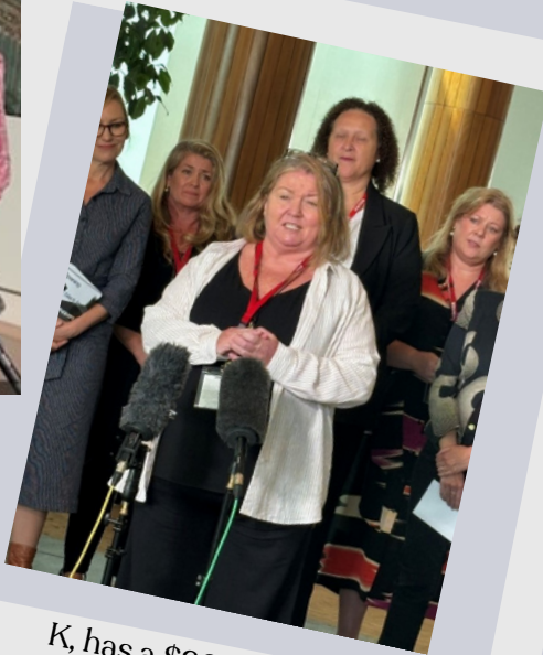
K, has a $200,000 Debt She lives with housing insecurity