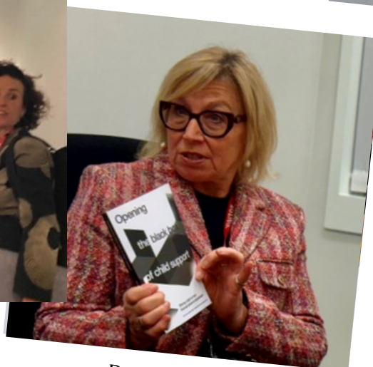
Rosie Batty, speaking to the report.