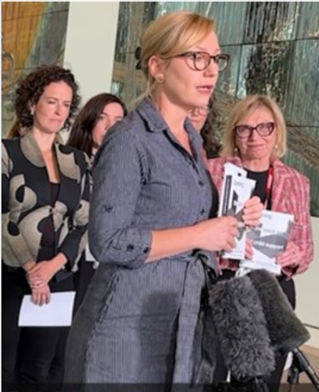
Senator Larissa Waters