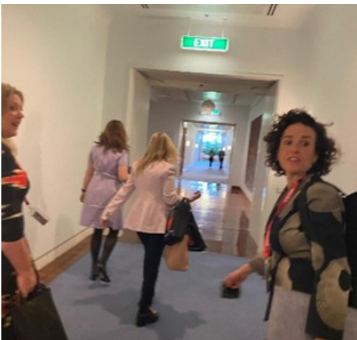
Full Program Running to the meeting.