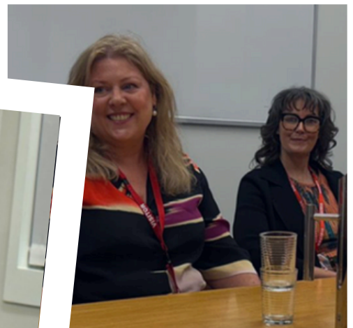
Women speaking of their lived experience.